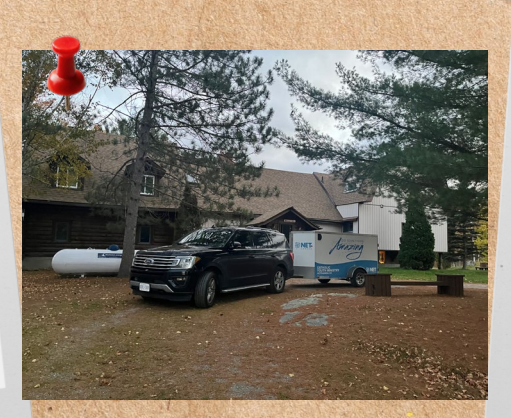
"We don't need to be perfect for God to love us."